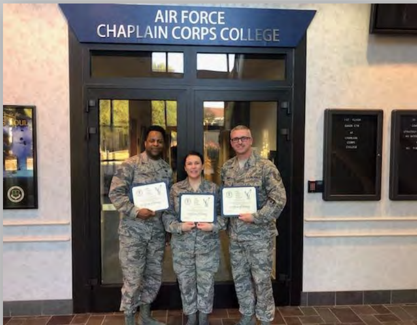
RAA Apprentice Course Graduates, Class 19001