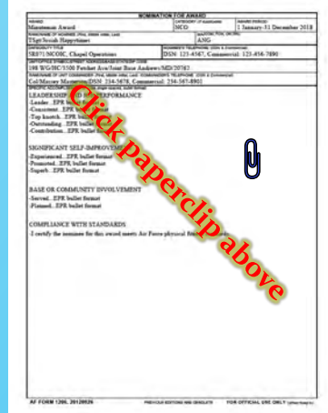
1206 with correct format