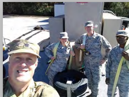
116 ACW, GA ANG. TFRSK training